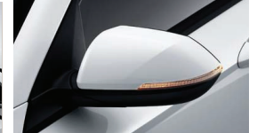
Outside mirror (Heated / Folding / Turn signal indicator LED)