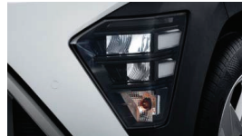
LED Headlamps (MFR)