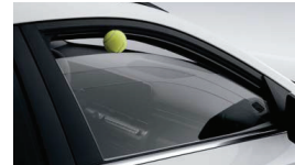
Safety power window