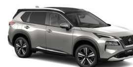
CHAMPAGNE SILVER/ BLACK