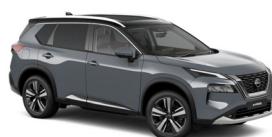
CERAMIC GRAY/ BLACK