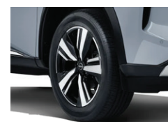
19 INCH ALLOY+235/55 R19