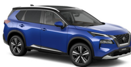
CASPIAN BLUE/ BLACK