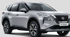
Nissan X-trail e-Power (Advance)