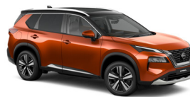
SUNSET ORANGE/ BLACK