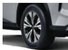
18 INCH ALLOY+235/60 R18