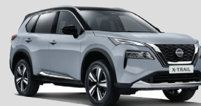
Nissan X-trail e-Power (Exclusive)